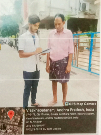
Visakhapatnam, Andhra Pradesh, India 37-3-78, Old ITI Area, Geyara Kanchara Palem, Kancharapalem, Visakhapatnam, Andhra Pradesh 530008, India Lat 17.735804° Long 83.269491° 11/07/23 09:24 AM GMT +05:30