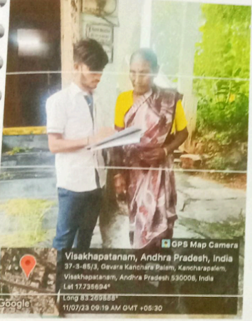
GPS Map Camera Visakhapatnam, Andhra Pradesh, India 37-3-85/3, Geyara Kanchara Palem, Kancharapalem, Visakhapatnam, Andhra Pradesh 530008, India Lat 17.735604° Long 83.269858° 11/07/23 09:19 AM GMT +05:30