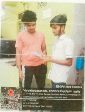
GPS Map Camera Visakhapatnam, Andhra Pradesh, India 37-3-23, Old ITI Area, Geyara Kanchara Palem, Kancharapalem, Visakhapatnam, Andhra Pradesh 530008, India Lat 17.735584° Long 83.269754° 11/07/23 09:24 AM GMT +05:30