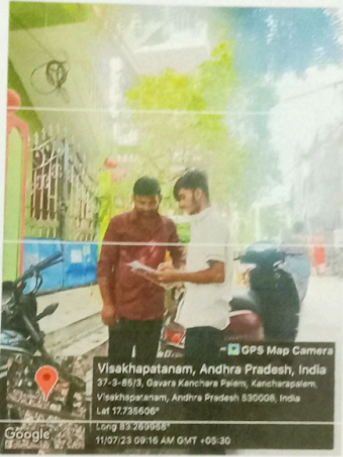
GPS Map Camera Visakhapatnam, Andhra Pradesh, India 37-3-85/3, Geyara Kanchara Palem, Kancharapalem, Visakhapatnam, Andhra Pradesh 530008, India Lat 17.735604° Long 83.269858° 11/07/23 09:16 AM GMT +05:30