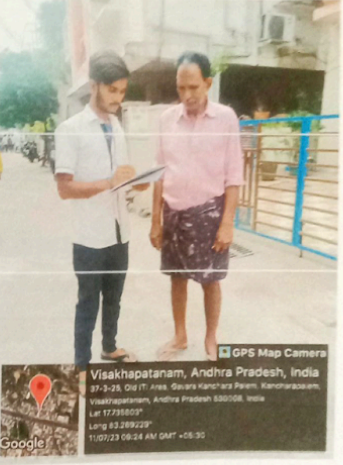
Visakhapatnam, Andhra Pradesh, India 37-3-25, Old ITI Area, Geyara Kanchara Palem, Kancharapalem, Visakhapatnam, Andhra Pradesh 530008, India Lat 17.735804° Long 83.269229° 11/07/23 09:24 AM GMT +05:30