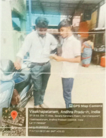
GPS Map Camera Visakhapatnam, Andhra Pradesh, India 37-3-33, Old ITI Area, Geyara Kanchara Palem, Kancharapalem, Visakhapatnam, Andhra Pradesh 530008, India Lat 17.735604° Long 83.269858° 11/07/23 09:21 AM GMT +05:30