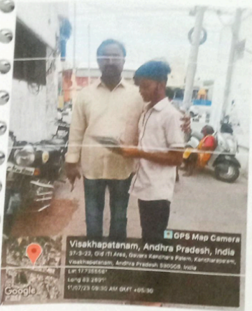
GPS Map Camera Visakhapatnam, Andhra Pradesh, India 37-3-23, Old ITI Area, Geyara Kanchara Palem, Kancharapalem, Visakhapatnam, Andhra Pradesh 530008, India Lat 17.735584° Long 83.269754° 11/07/23 09:30 AM GMT +05:30