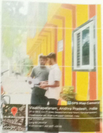
GPS Map Camera Visakhapatnam, Andhra Pradesh, India 37-3-23, Old ITI Area, Geyara Kanchara Palem, Kancharapalem, Visakhapatnam, Andhra Pradesh 530008, India Lat 17.735584° Long 83.269754° 11/07/23 09:11 AM GMT +05:30