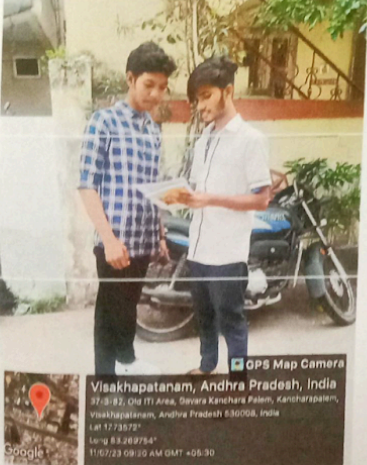
GPS Map Camera Visakhapatnam, Andhra Pradesh, India 37-3-78, Old ITI Area, Geyara Kanchara Palem, Kancharapalem, Visakhapatnam, Andhra Pradesh 530008, India Lat 17.73572° Long 83.269784° 11/07/23 09:10 AM GMT +05:30